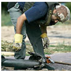
Rocket lands in Sderot