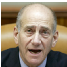
Prime Minister Ehud Olmert